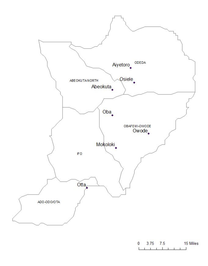
FIGURE 3. Egba Local Government Areas in Ogun State