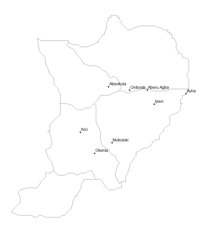
FIGURE 4. Punch's Tour of Egba Country, 1902