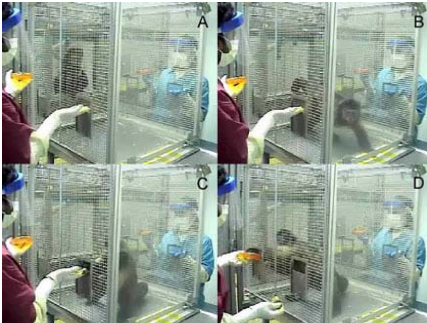
Figure 1: A capuchin decides which experimenter to trade with. The subject enters the testing chamber (A), takes a token from a tray (B), places it in the hand of an experimenter

Trading was conducted in a cubical testing chamber (28 inches wide) that was adjacent to the main cage, and into which subjects entered voluntarily. Two panels on opposite sides of the chamber allowed participants to interact with experimenters through rectangular openings, large enough for the capuchins to reach out of [and experimenters to reach into] the testing chamber (see figure one). In each trial, two potential trades were offered on opposite sides of the cube, and the subject made its choice between these two options by choosing which experimenter to exchange a token with. All sessions were videotaped in addition to an RA recording each actor's string of choices. The experimental trading protocol is pictured below.