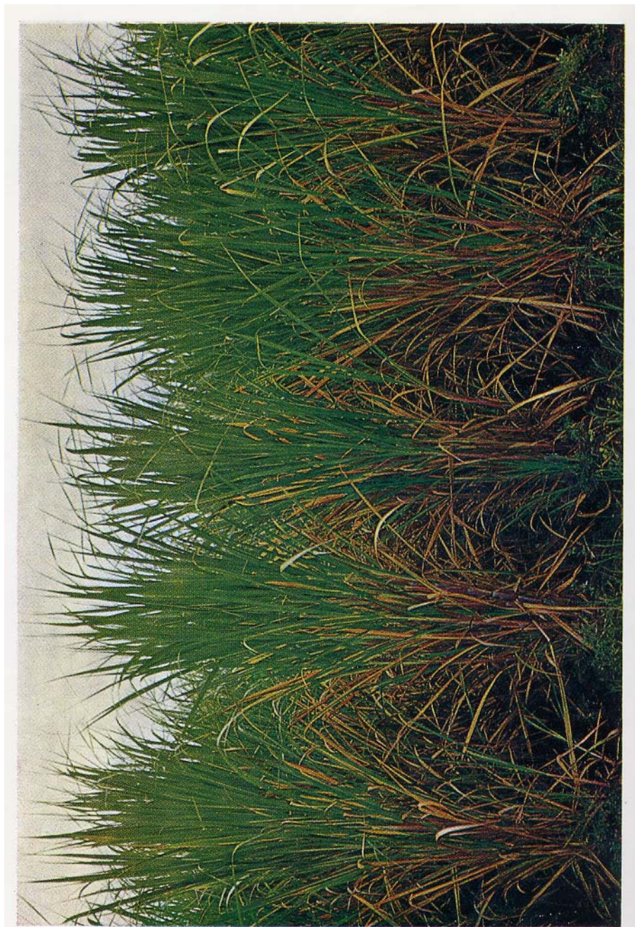
Fig. 76. Potassium-deficient cane at Xicotencatl, Mexico. The older leaves show characteristic orange-brown color with marginal firing. The younger leaves are dark green in color and appear to have developed from a common point, giving a bunched-top appearance. Courtesy of David McKay Co., Inc. (ref. 568a).

Figure 1: Sugarcane shows signs of a specific type of nutrient stress. Source: Humbert [14] p. 132, (colored).