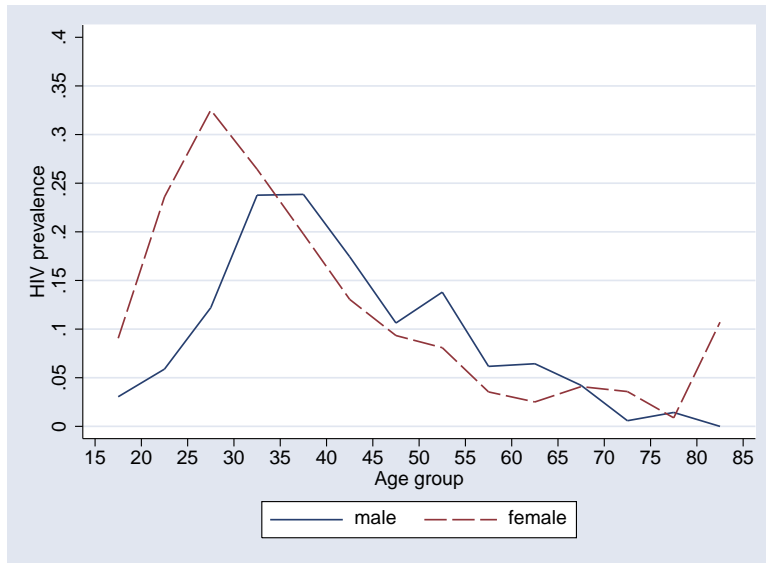
Figure 1: Age profile of naïve HIV prevalence